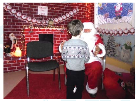
Santa Visits Macroom FRC

Our interventions have proven to be a mixed bag of experiences. By its nature this type of support is provided in an atmosphere which is adversarial and sometimes aggressive. We often question our capacity to effectively