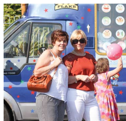
Fun for all ages