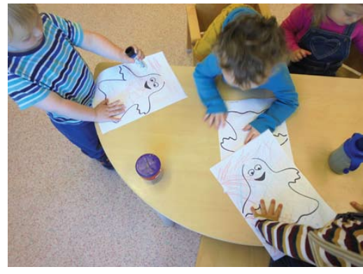
Drawing is always fun

We attempt when possible to benefit from the supports provided through Community Employment and TUS programmes. In this regard collaborate with Muskerry Community Employment Project and West Cork Development. Our capacity engage in these programmes is limited by the security barriers which are part of childcare in Ireland and by the